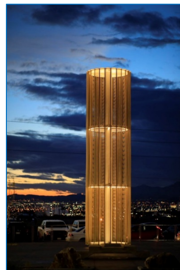
The Great Candela Memorial outside the Cielo Vista Walmart

The tragedy and one year remembrance of Aug. 3 rd reminds every healthcare worker that their career is more than a job, but a calling. As we look where we are now as a city, the ongoing COVID-19 pandemic has created a new challenge that once again is calling on the very same people that helped save lives one year ago – Healthcare Heroes.